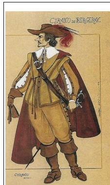
Cyrano de Bergerac