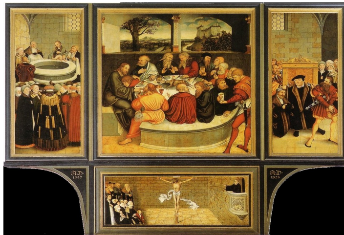
16 th c. altar painting in St. Mary’s Church in Wittenberg, Germany (by Cranach). The panels show the four primary ways Christ’s word of forgiveness comes to us: Holy Baptism, Lord’s Supper, Confession and Absolution, and Preaching.

If you say, “God is a joke and I don’t need Him or His tales of salvation.” That is unbelief. With that, your sin remains on you, and you will be bared from the Gates of Heaven.